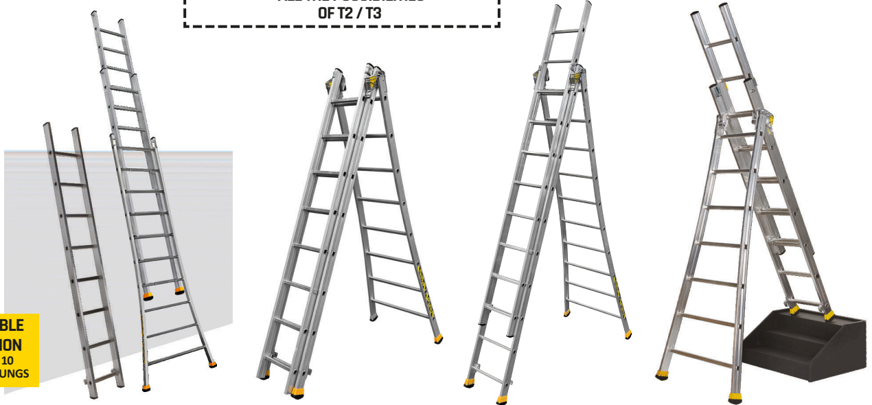
POSITION LEANING LADDER

REMOVABLE 3 RD SECTION UP TO 2 x 10 AND 3 x 10 RUNGS