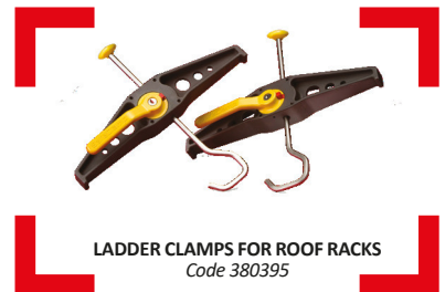
LADDER CLAMPS FOR ROOF RACKS Code 380395