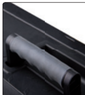
ergonomic anti-slide handle