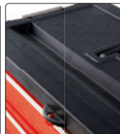
working table top