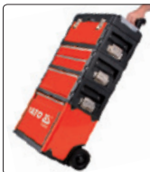
wheels and telescopic handle

420x220x150 mm max 20 kg 390x215x130 mm max 10 kg 410x210x280 mm max 15 kg