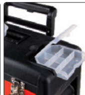
two removable organizers