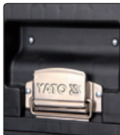
metal clips for module joining