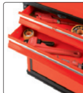
drawers on guides with ball bearings